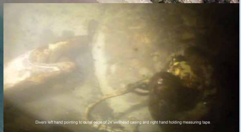
Divers left hand pointing to outer edge of 24' wellhead casing and right hand holding measuring tape.