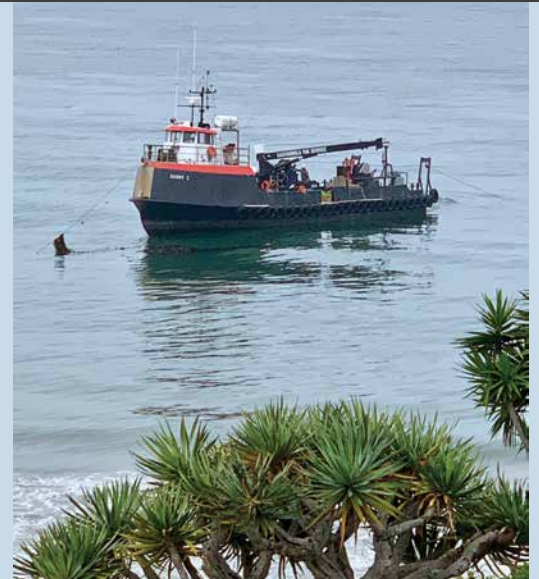
The Danny C arrives off Summerland Beach to bring investigative divers